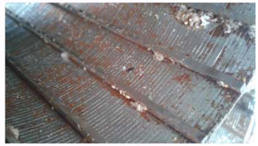
View from inside ( ID )