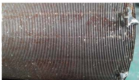
View from out side ( OD )